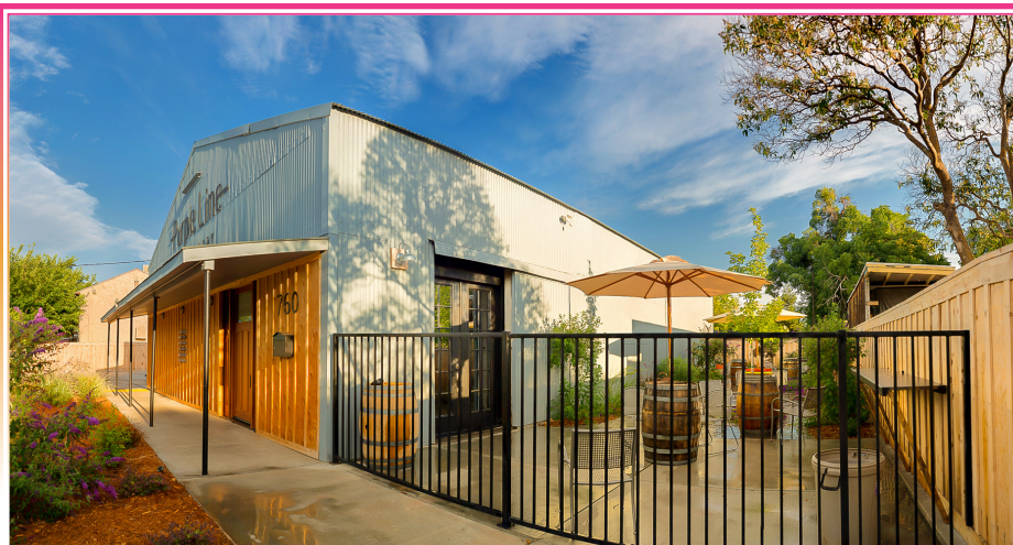
Purple Line Urban Winery is described as "Warehouse Chic" offering a unique wine tasting experience. This urban aesthetic setting is an attractive alternative type of event venue for gatherings and special events.

The Wine Room in Paradise, with its charming ambiance, offers a wide selection of local and domestic wines. Fifteen craft beers on tap along with a wide choice of bottled beers provide a perfect beer tasting experience. Wine lovers can chose from 6 - 10 varietals to taste by the glass plus local and domestic wines are available by the bottle. Try something from the menu to nosh on by choosing one of the delicious small plates featuring "Pub Grub" from The Wine Room chef.